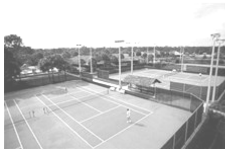
6 Lighted Tennis courts